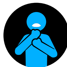
Shortness of Breath