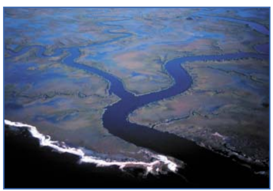
The ACE Basin

The floodplains are an important asset. They provide open space, aesthetic pleasure, and areas for active and passive uses.