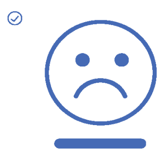
HAVE SUDDEN, SEVERE PAIN